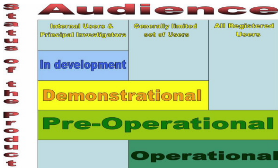
Fig. 2.5-1 Audience per Product Status

As already introduced in the Product Definition (chapter 2.1), the product purpose and product audience drive the implementation of the EUMETSAT Product Services. Each product status decided by the PVRB has a recommended product audience which implies a different delivery mechanism solution: