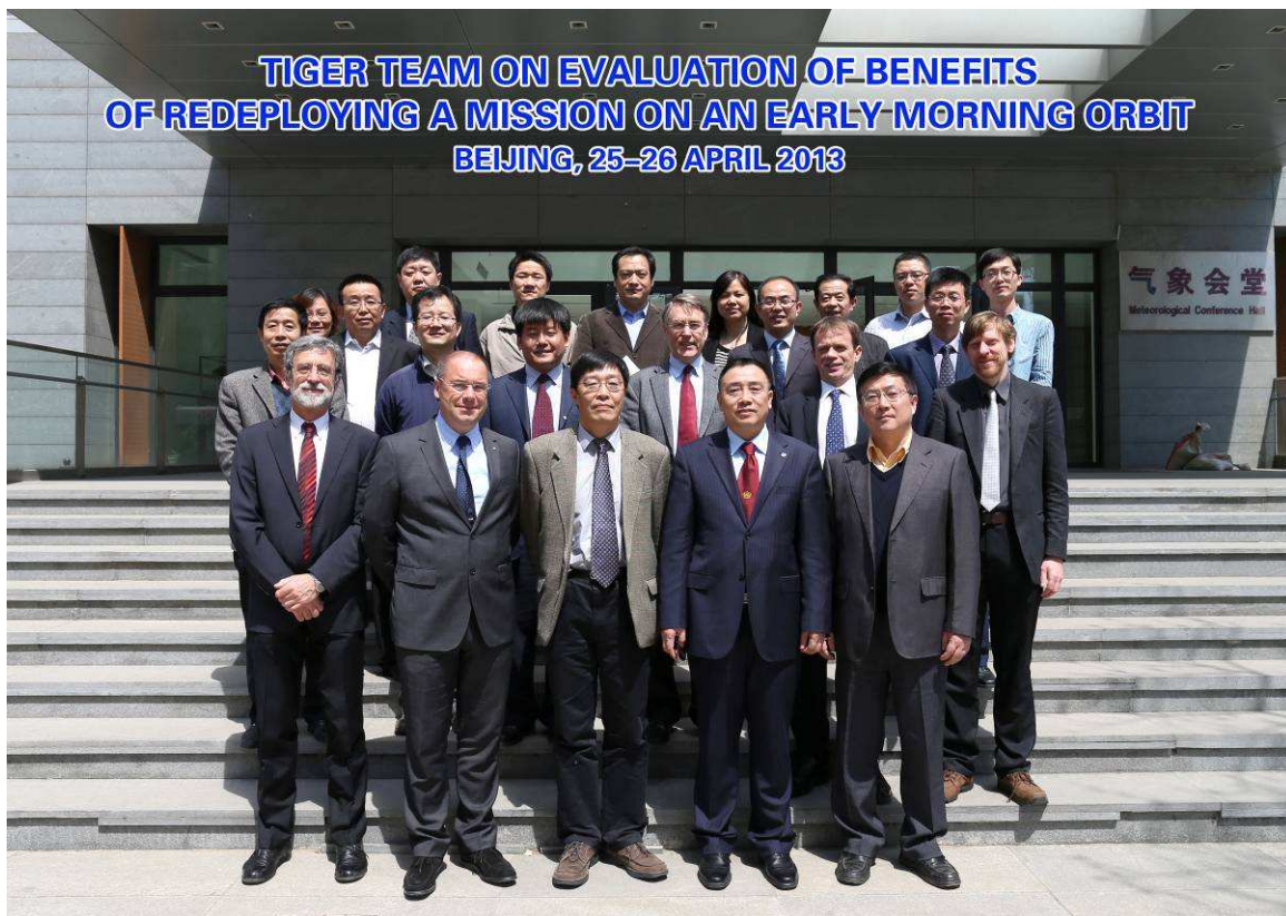
Figure 1: Participants in the Tiger Team seminar.

The report is based on the work of the Tiger Team established on this matter by the World Meteorological Organization (WMO) and CGMS. It summarizes the outcome of the Tiger Team seminar hosted by CMA in Beijing on 25 and 26 April 2013.