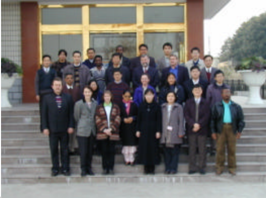
Figure 2. Students from the Nanjing, China WMO workshop held in December 2002.

The Asian Pacific Satellite Applications Training Seminar (APSATS) held at the RMTC in Melbourne in May 2002 was conducted successfully using the VL approach. During the APSATS, the following accomplishments were attained: