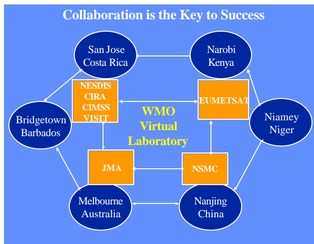
Figure 1a. Schematic illustration of Virtual Laboratory for Satellite Meteorology.

The Virtual Laboratory for Satellite Meteorology benefits greatly from work done by CIRA, the Cooperative Institute for Research in the Atmosphere, at Colorado State University, in the early to mid 1990's.