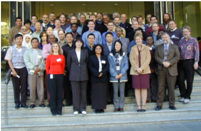
Figure 3. Participants at the APSATS 2002 workshop in Melbourne, Australia.