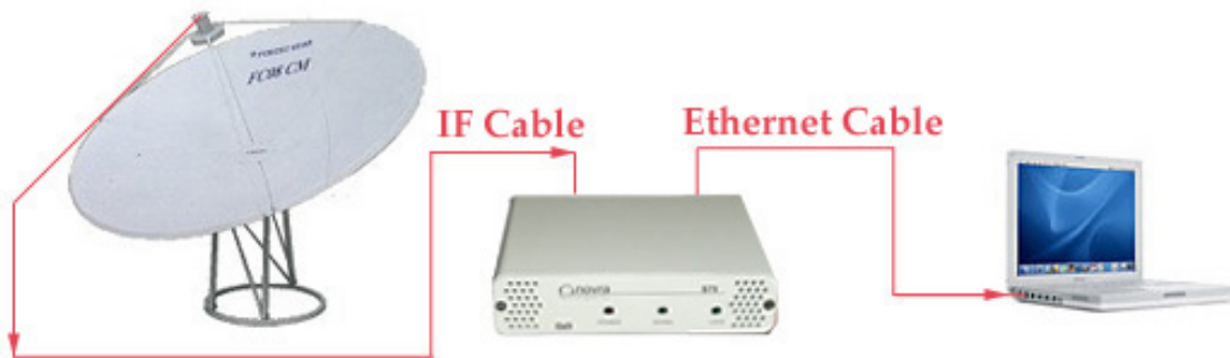
Figure 2-2: Prototype of ADM User Terminal

Downconverter (LNB), and receiver (demodulator). The ADM User Terminal currently receives a 10.24 Mbps C-band broadcast from the AMC-4 satellite. This broadcast utilizes the DVB-S (Digital Video Broadcast-Satellite) format, which is the data format that was chosen for ADM during the ADM Architecture Study Phase.